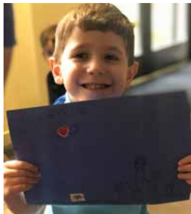
Above: Mother's Day Craft-Tea brought smiles.