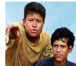
“Which Way Home”

Join us during the summer as we explore together through film, the many ways we can individually and corporately continue our work as transforming agents in the world and in community.