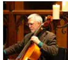
The Well, 5 p.m. service

The Cathedral’s Sunday 5 p.m. Eucharist is named “The Well,” and it provides soul-slaking water. The