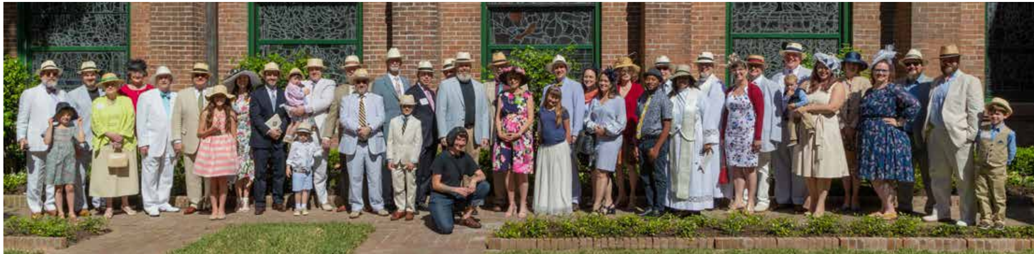
Above: Cathedral parishioners and their spectacular hats, bonnets, and fascinators on display for Easter Sunday this year.