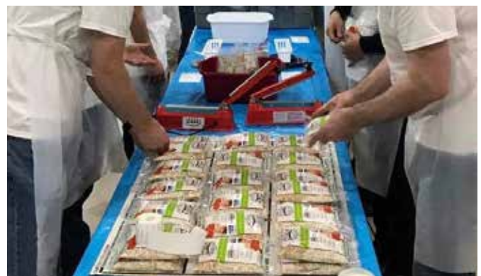
This year on Rally Day, the Cathedral will work together to build 100,000 meals.

For the children of Blackshear Elementary in Houston's Third Ward, a Friday school cancellation means that they will not receive the weekend meal bag provided to them by Bayou City Blessings in a Backpack. That means some of those children who live within a stone's